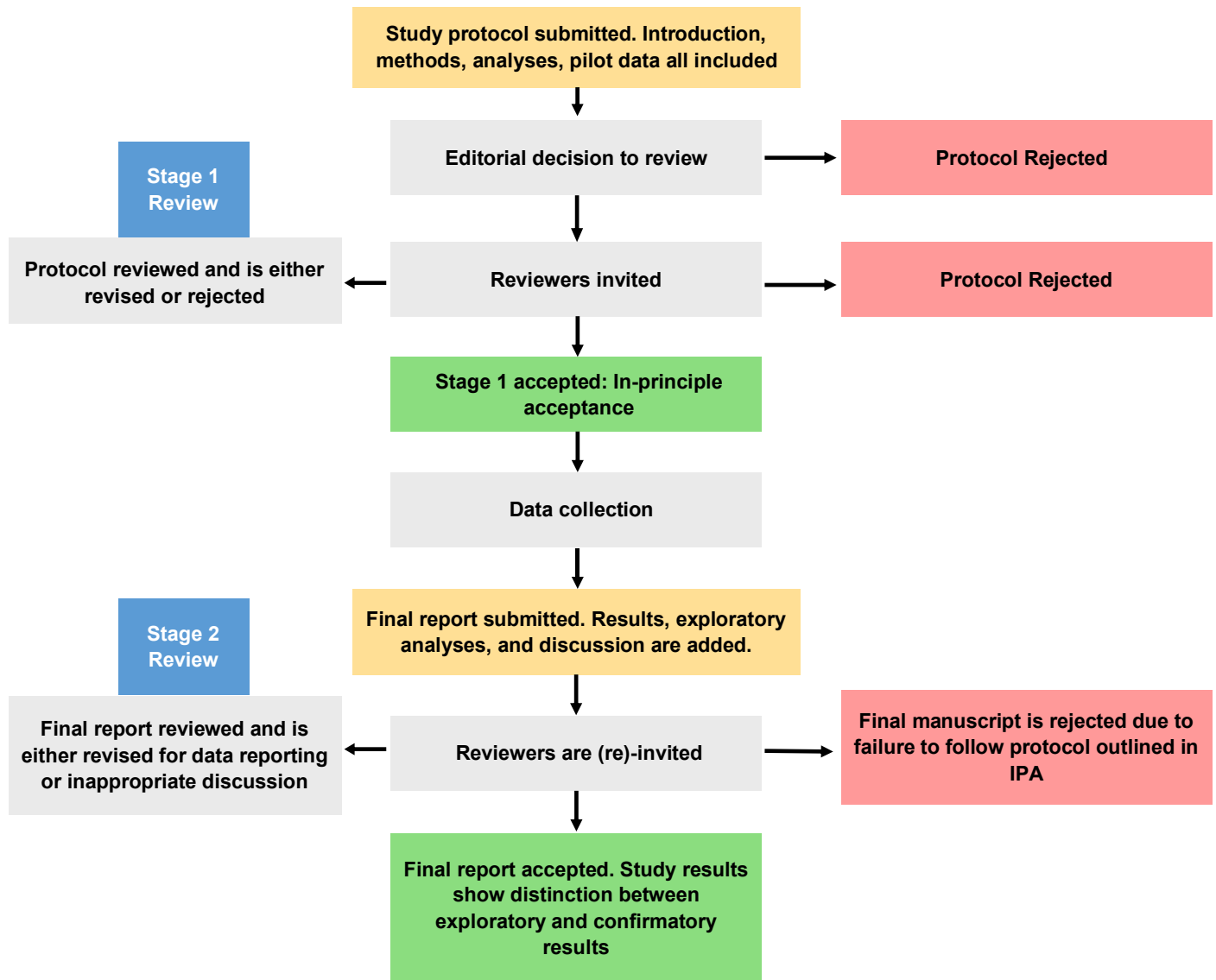
Figure 2: The Registered Reports Process.

Before starting data collection, the authors submit the study rationale and methods for peer-review (Stage 1). After the study is scrutinized by the editor and reviewers, it will either receive an in-principle acceptance (IPA) or is rejected. If the study receives an IPA, the authors may proceed to data collection. Once the authors complete the study, they are to analyze and interpret the data in accordance with the Registered Report that was accepted in Stage 1. The authors then re-submit the completed study for Stage 2 review, which is ideally quickly accepted under the condition that the results are interpreted reasonably, and the study was completed in accordance with the methods proposed in Stage 1. Yellow = submission by the authors; red = rejection; green = acceptance.